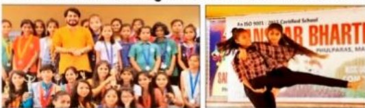
पुस्तक प्रदर्शनी के कार्यक्रम में बच्चों के साथ शिक्षकों की टीम का तस्वीर